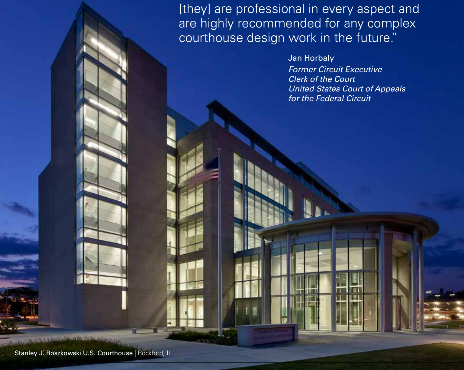
Stanley J. Roszkowski U.S. Courthouse | Rockford, IL