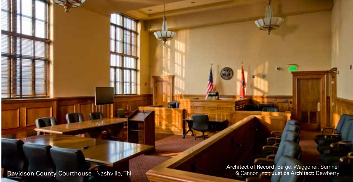
Davidson County Courthouse | Nashville, TN

Architect of Record: Barge, Waggoner, Sumner & Cannon Inc.; Justice Architect: Dewberry