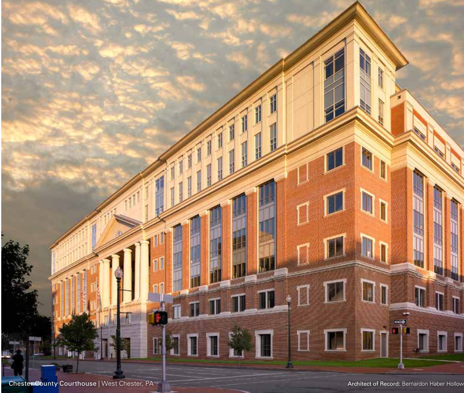
Chester County Courthouse | West Chester, PA