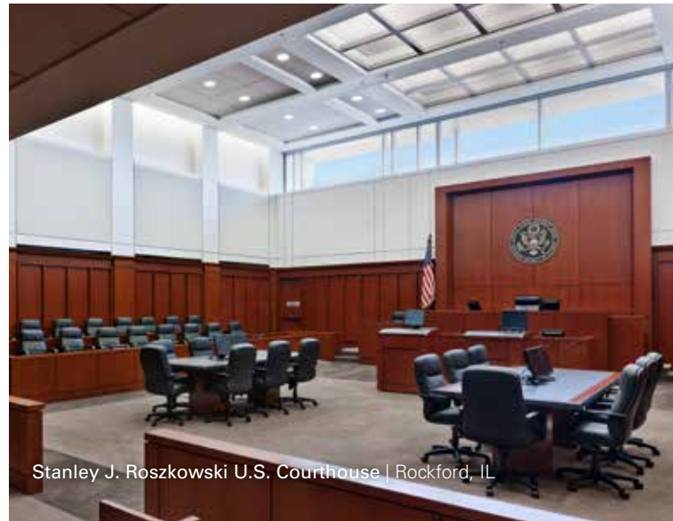
Stanley J. Roszkowski U.S. Courthouse | Rockford, IL